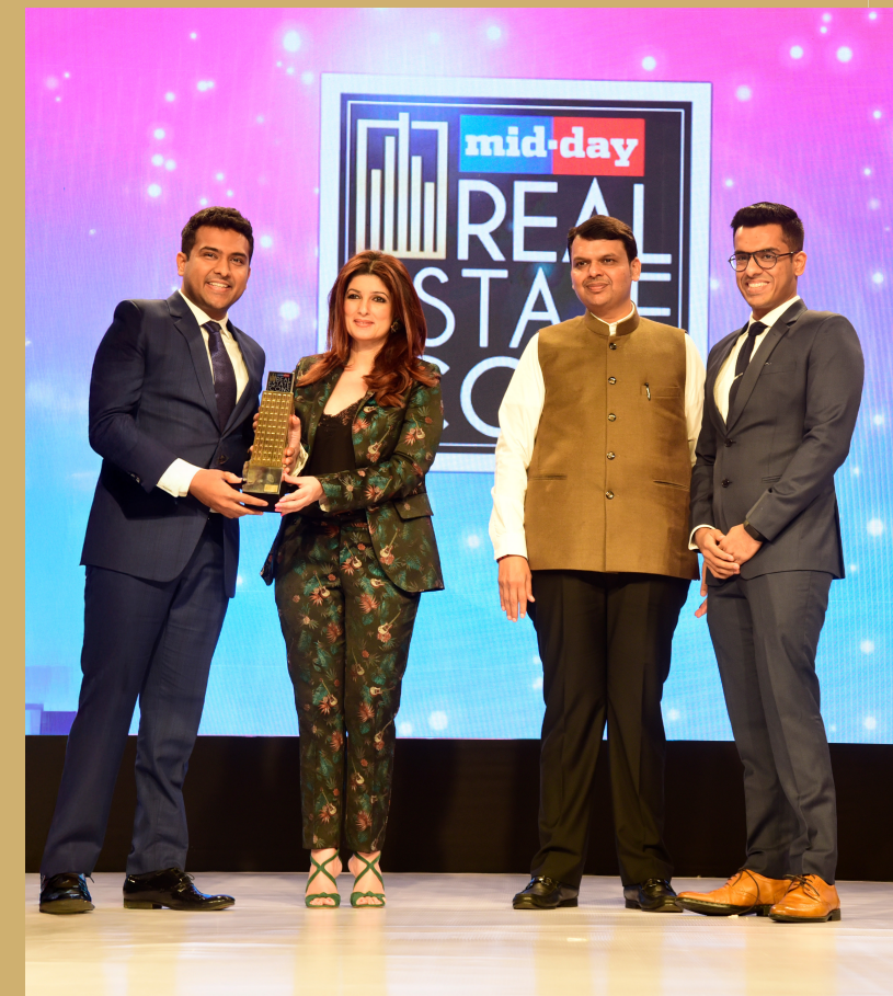
MID-DAY REAL ESTATE ICON AWARD 2018