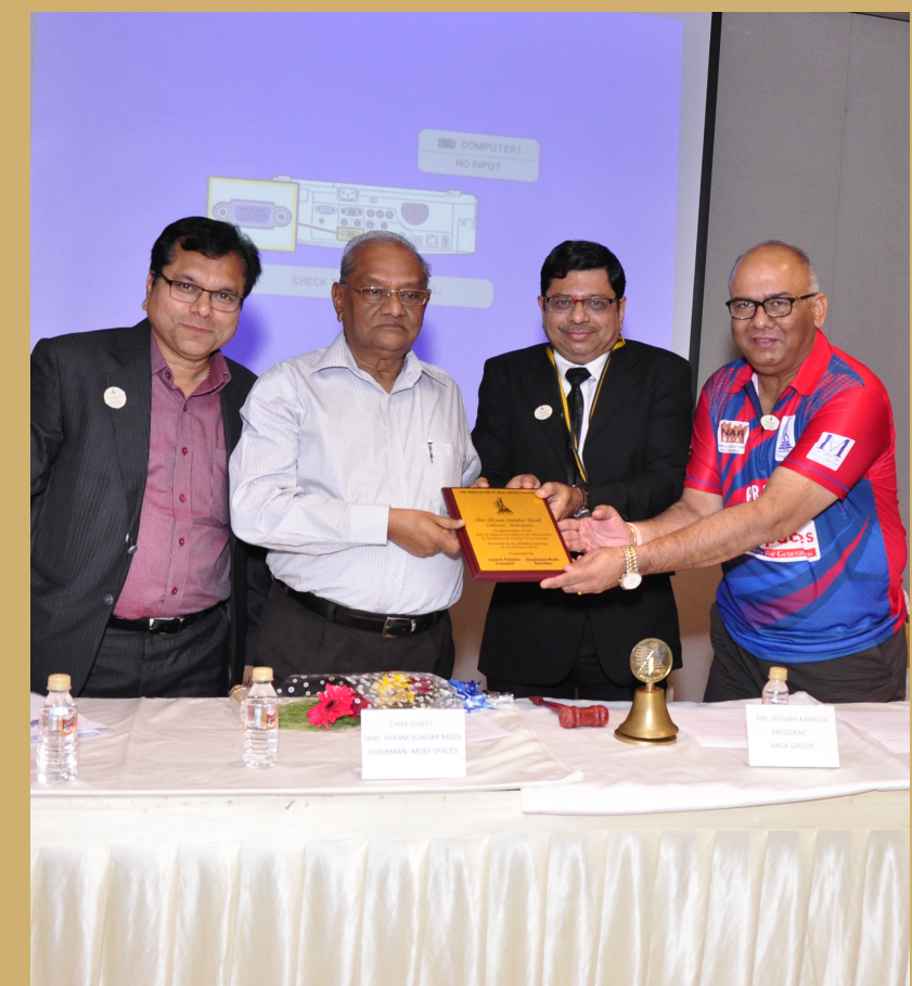
AREA GROUP AWARD