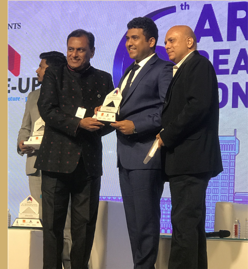
AREA SCALE UP 2019, PANELIST