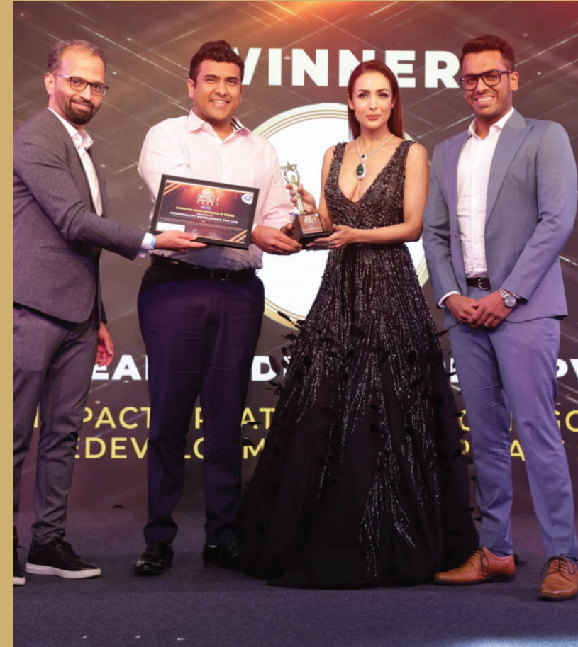
BIG IMPACTS AWARDS 2023