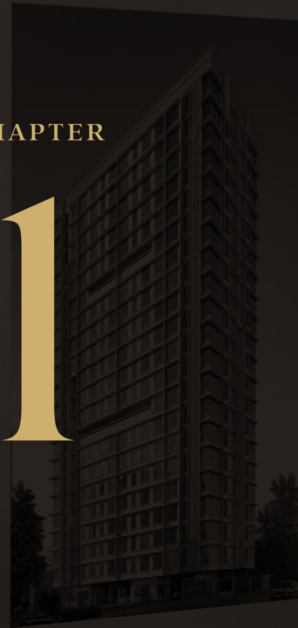
MODIREALTY AGACIA, BUILDING NO 9, SHAILENDRA NAGAR, SHIV SHAKTI COMPLEX, DADISAR EAST, MUMBAI, MAHARASHTRA 400063